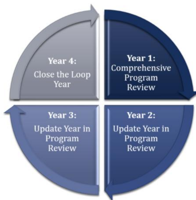
Figure 2: Instructional Program Review 4-Year Cycle Flow Chart