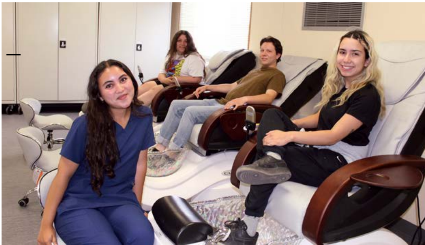
VVC's ASB gets a first look at the new cosmetology program on lower campus.