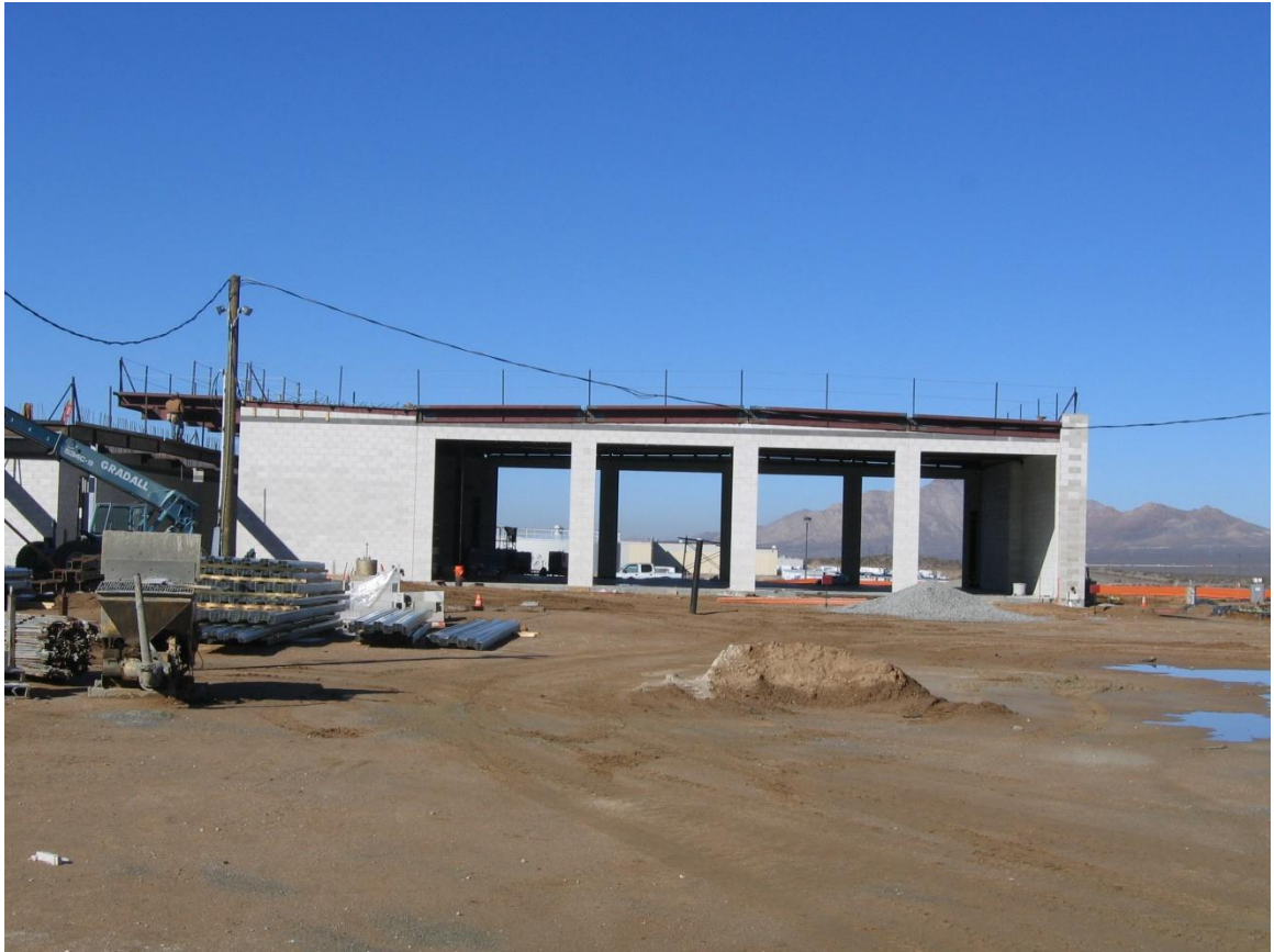
Apparatus Bay (Building C)