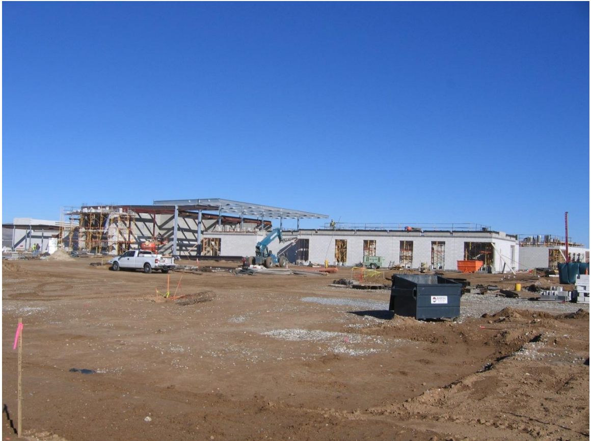
South Elevation – Canopy Steel