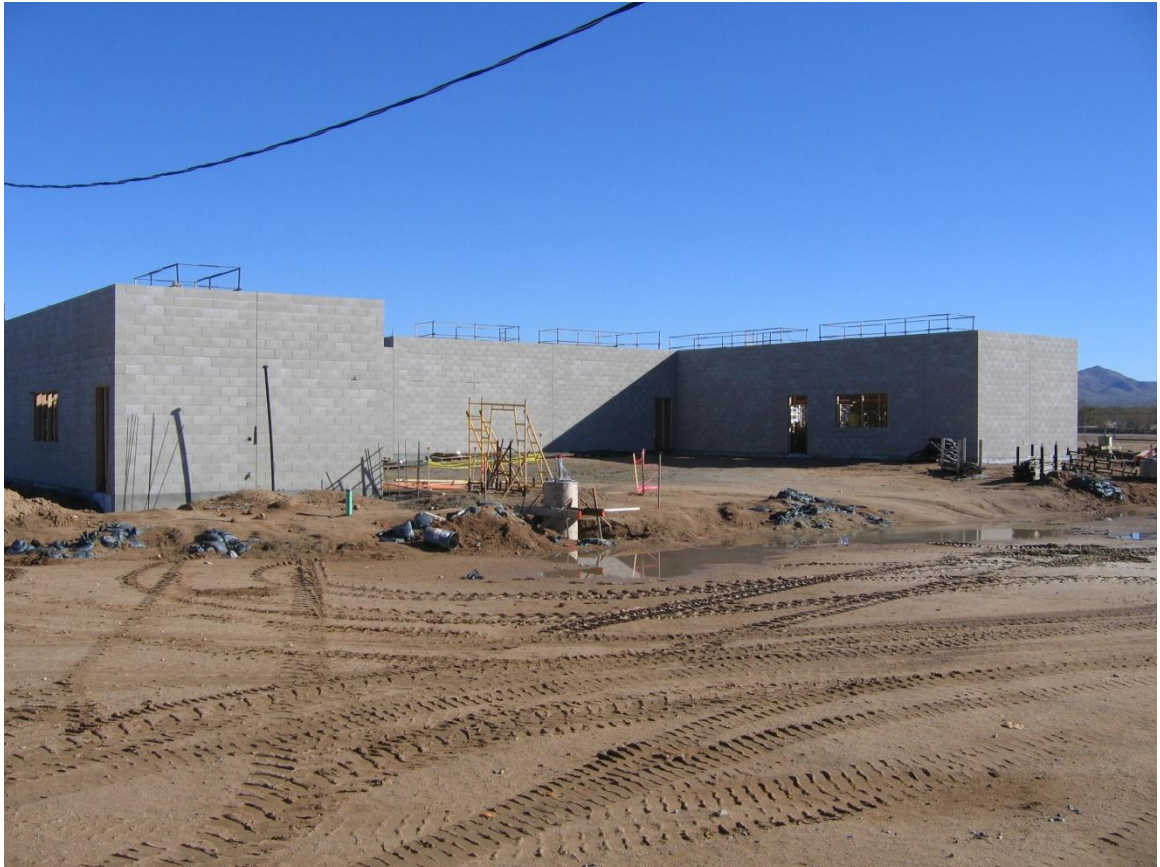
CERT City Prop