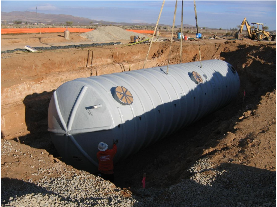
Drafting Pit Tank