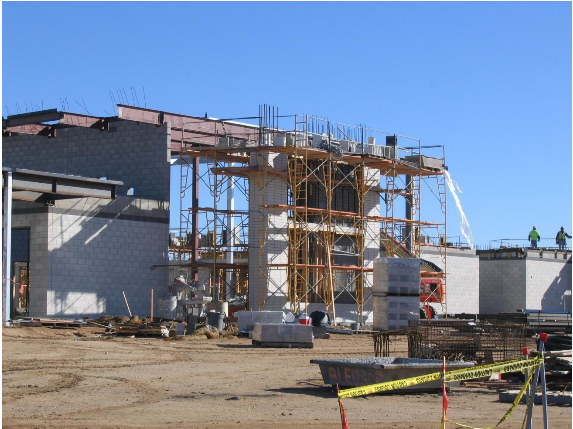
South Elevation Main Entrance Feature Wall