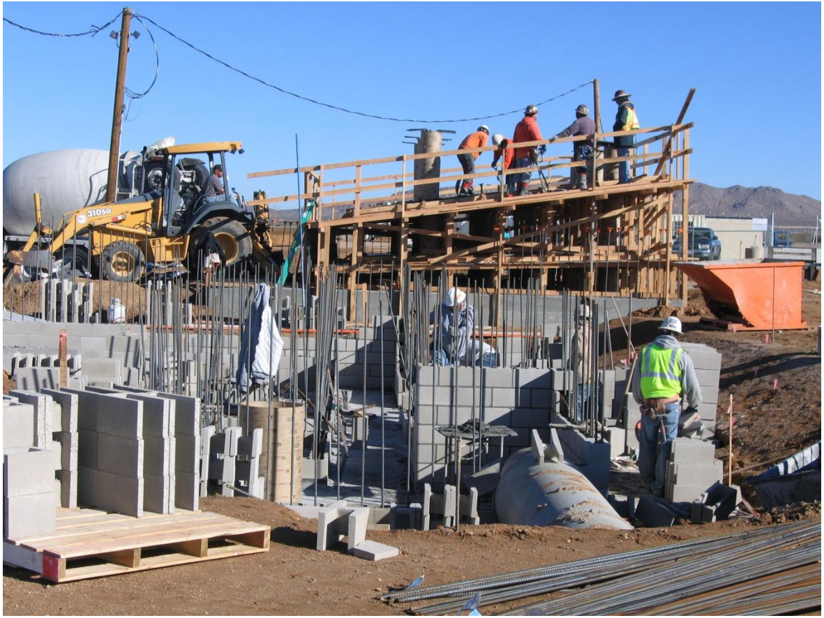
Collapsed Trench Prop