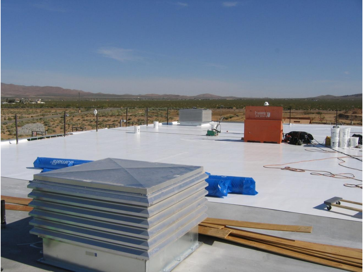
Apparatus Bay Roofing Installation – June3, 2011