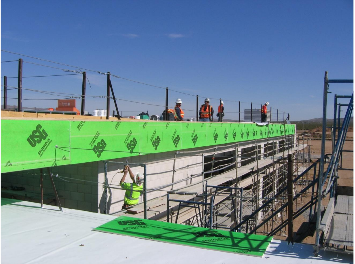
Apparatus Bay Exterior Soffits – June 3, 2011