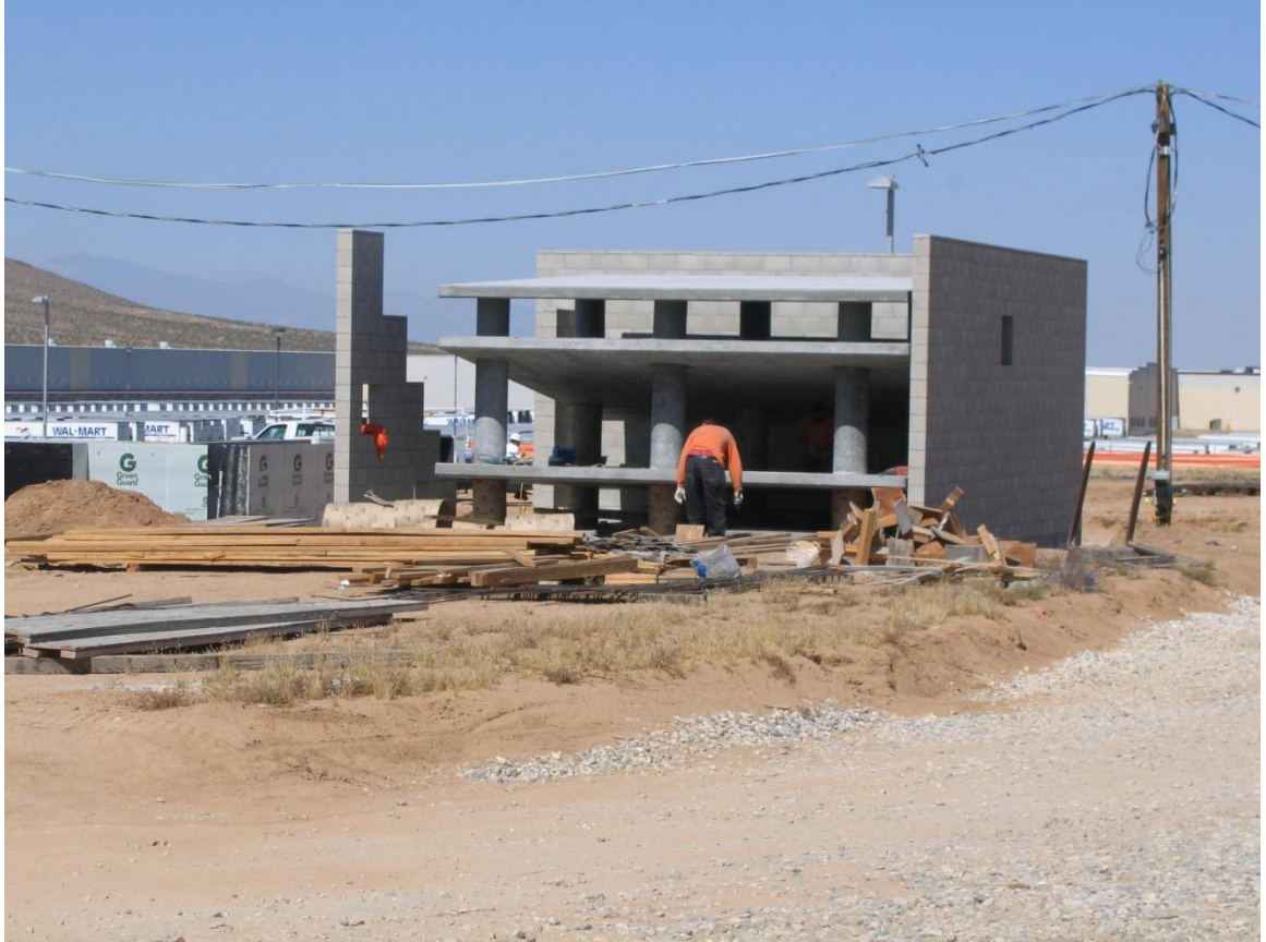
Collapsed Building Prop – June 3, 2011