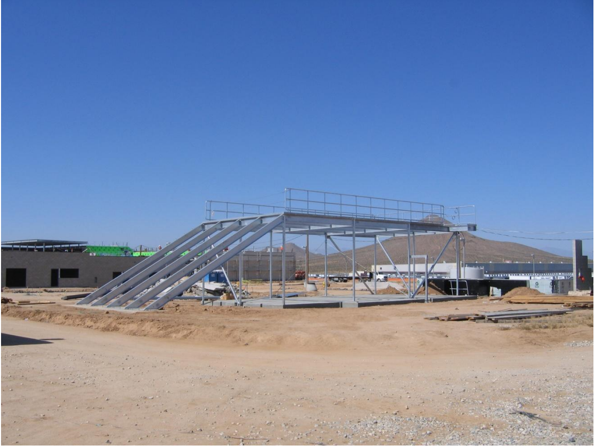
Low Angle Rescue Prop – June 3, 2011