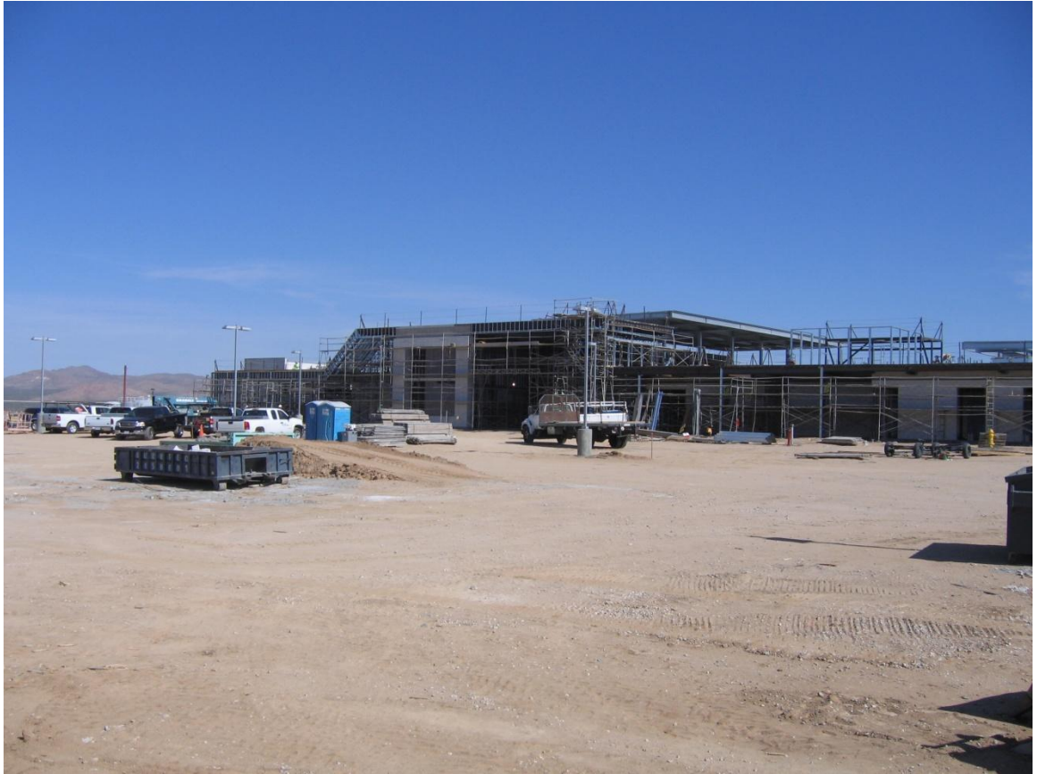
North Exterior Elevation – June 3, 2011