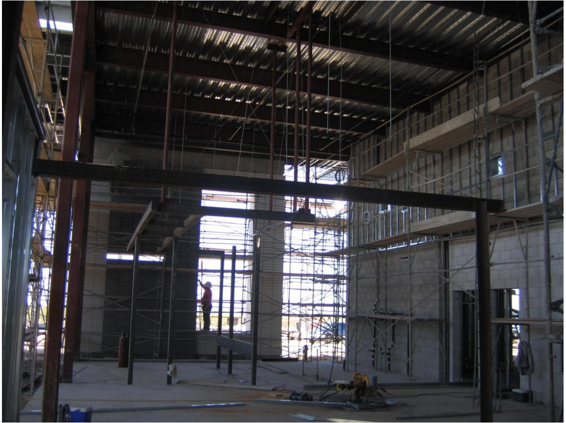
Area 'A' Main Entry and Reception Area – June 3, 2011