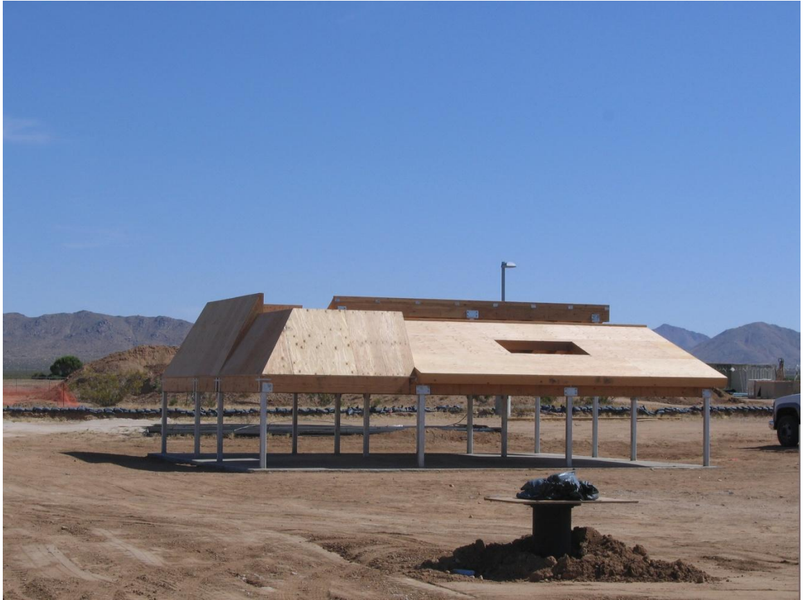
Roof Ventilation Prop – June 3, 2011