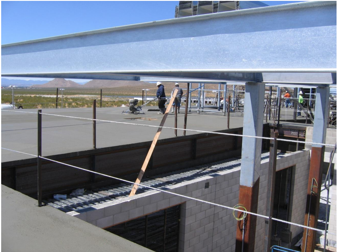
Area A Concrete Roof Pour – May 19, 2011