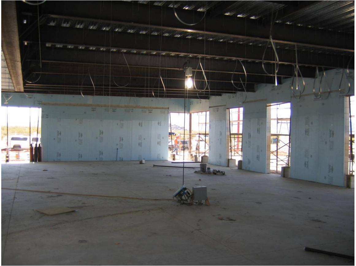
Area 'A' FTI Lab #3 – June 3, 2011