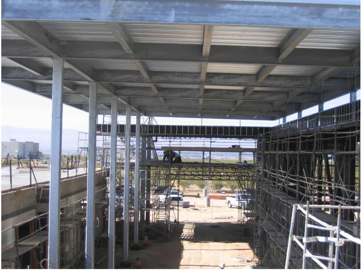
Area 'A' Roof Canopy – June 3, 2011