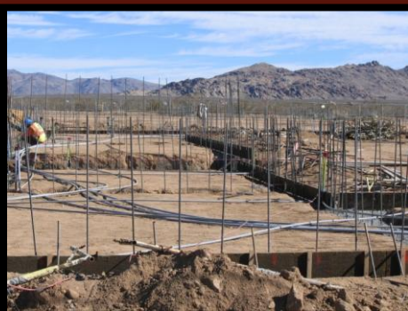
CERT City Foundations