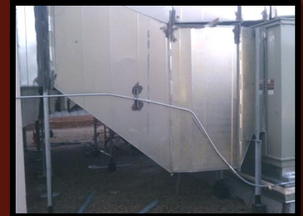
New Cooling System