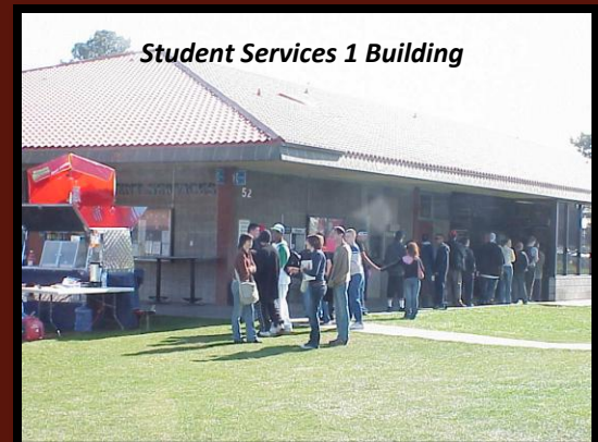
Student Services 1 Building

The college continues these efforts to make the campus a safer place by moving forward with repairs to more parking lots and campus-wide roadways. You can expect more parking lot and roadway construction in the summer of 2011.