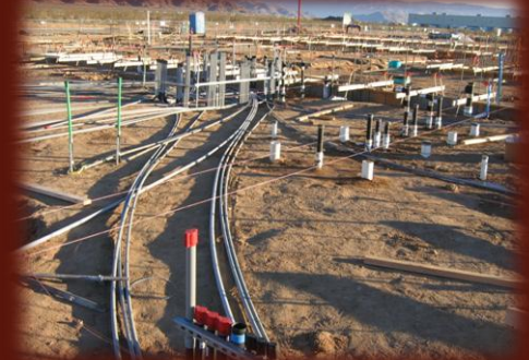
Building B Utilities

In the spring of 2010, the following required environmental reports were completed and approved: