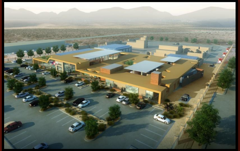
Rendering of the Public Safety Training Center

It is a formal educational center, a Commission-approved off-campus operation, owned or leased by the parent district and administered by a parent community college. It offers instructional programs leading to certificates or degrees conferred by the parent institution. The Commission recognizes, as does the Chancellor's Office, that educational centers are a cost-effective alternative to building full-service campus. They can increase learning productivity, promote local economic development and help community college districts to serve rural and remote areas.