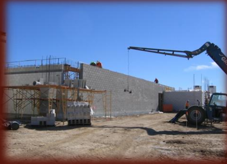
Building B Firing Range