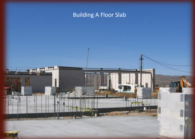
Building A Floor Slab

A Mitigated Negative Declaration (MND), which is the environmental document needed to fulfill the District's obligation under the California Environmental Quality Act (CEQA), was completed and released for public review on March 8, 2010. On May 11, 2010, the VVCCD Board adopted the MND in compliance with the California Environmental Quality Act which allowed them to proceed with construction, subject to environmental monitoring.