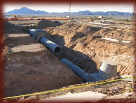
Confined Space Prop

Highland Partnership Inc. submitted the site and building design packages in March 2010 to the Division of State Architects (DSA) for its required approval before construction could begin.