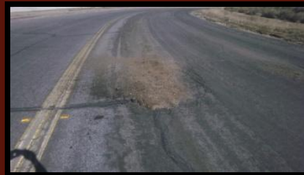
Need for Roadway Removal and Replacement