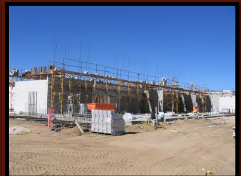
Building B Admin Area