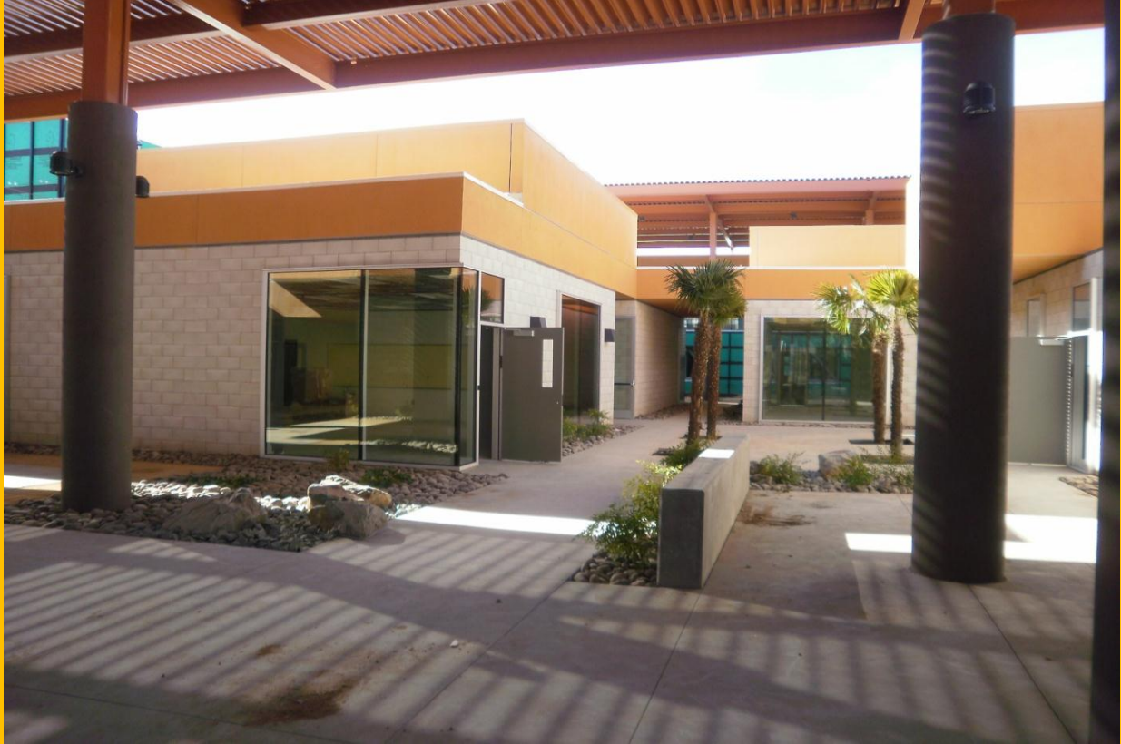
STUDENT COURTYARD AT THE NEW REGIONAL PUBLIC SAFETY TRAINING CENTER