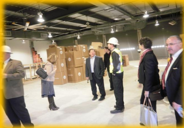
CBOC members are given an on-site construction project report at the Regional Public Safety Training Center.

In November 2008, a general obligation bond proposition Measure JJ of the Victor Valley Community College District was approved by more than fifty-five percent of voters in the District. The Election of 2008 authorized the District to issue up to $297,500,000 of general obligation bonds to upgrade, expand, and construct school facilities. The passing of this bond will enable the college to meet the needs of its growing community.