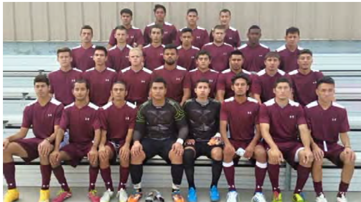
Men's 2015 Soccer Team

With a record such as this, the Rams have a great shot at becoming conference champions on October 9 th . VVC Rams faces Palomar College next. Keep up the great work Rams.