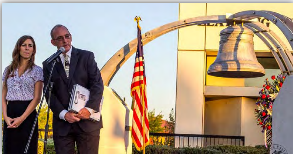
Moment of silence at VVC 9/11 Memorial