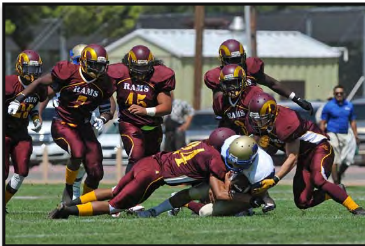
On their home field, Rams stop West LA College. East LA College Saturday, October 3.