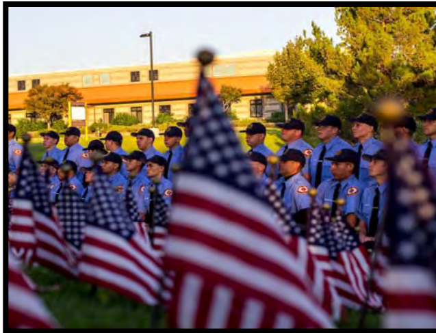
Members of the 44th Victor Valley College Fire Academy.

Four planes, departing from East Coast airports and bound for California were hijacked by terrorists. Two planes struck the World Trade Center Towers, another the Pentagon, and the fourth crash landed in a field in Pennsylvania. What most people may not know is that on the campus of Victor Valley College, this nationally recognized "day in infamy" a ceremony to celebrate those who gave their lives in effort to save those in danger is held. This gathering included not only Academy